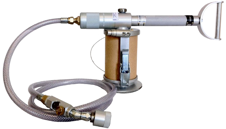
(Assembly shown with packing tube in place of oil can)

The special 1600 filter element (beta 200 = 4.6 micron, in accordance with ISO 16889) fitted to Risbridger equipment dispenses filtered fluids to a cleanliness level of DefStan 05/42 400F or ISO 4406 Class 17/15/12.