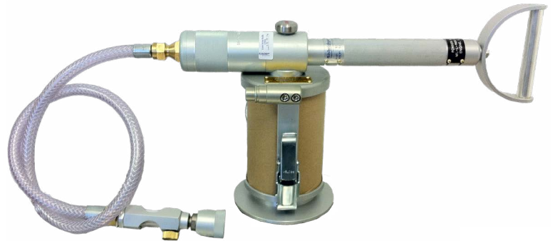
(Assembly shown with packing tube in place of oil can)

The special 2 micron (Beta 200 rated) filter elements fitted to Risbridger equipment dispense filtered fluids to a cleanliness level of DefStan O5/42 (better than 400F or ISO 4406 Class 11/7)