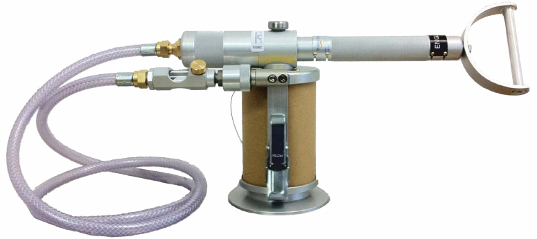
(Assembly shown with packing tube in place of oil can)

The special 2 micron (Beta 200 rated) filter elements fitted to Risbridger equipment dispense filtered fluids to a cleanliness level of DefStan O5/42 (better than 400F or ISO 4406 Class 11/7)