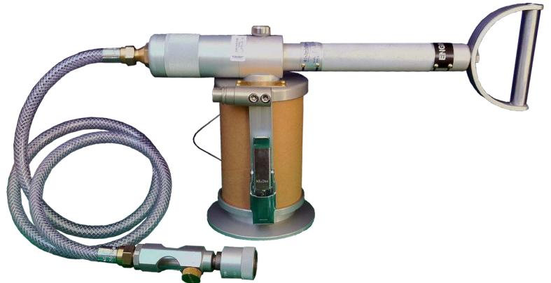
(Assembly shown with packing tube in place of oil can)

Obsolete drawing reference: UZ/7/1606/5 and UZ/7/1826